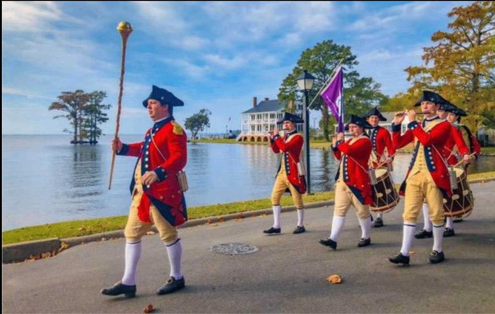
Edenton Historical Commission Town Council Meeting April 27, 2026