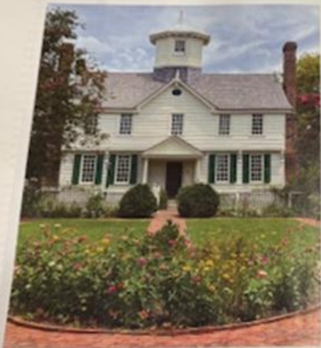
Part one: The magnificent woodwork of Edenton's 1758 Cupola House is the heart of the home.