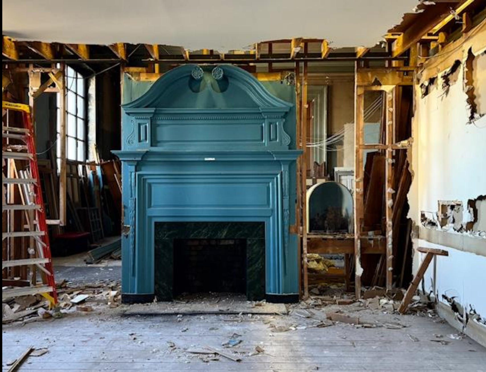
Cupola House Woodwork Project