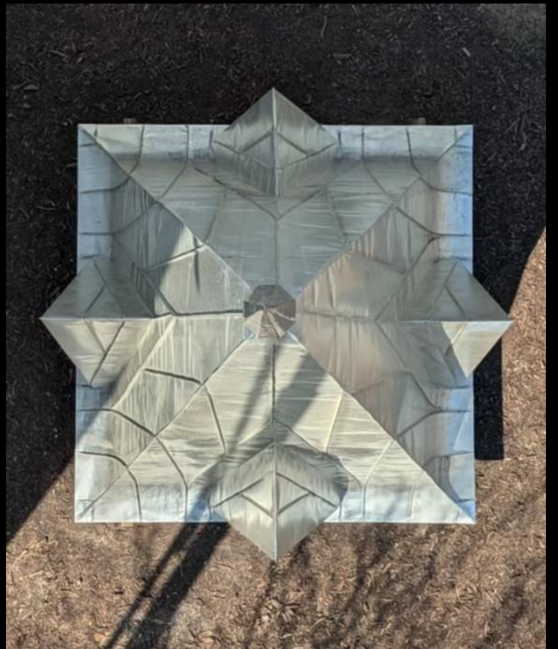
Kadesh Restoration Project